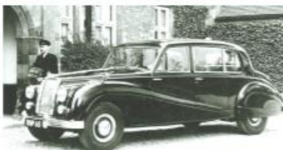
Sapphire Limousines like this one were extensively used in the 1950s to the mid 1960s by the Federal Government