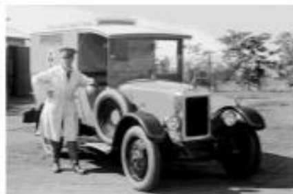
*3 & *4 A/S service vehicles were a common sight in Canberra in the 1920s, as the above pictures of a 'dashing' 14Hp Fire Chief's car and ambulance show