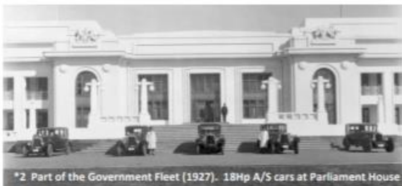
*2 Part of the Government Fleet (1927). 18Hp A/S cars at Parliament House

Members of the Armstrong Siddeley Car Club of Australia, as a part of our celebration of the Centenary of the marque, invite you to visit us at Old Parliament House on Saturday, 30th March, 2019, between 10am and 3pm, where we will present a large selection of these 'Cars of Aircraft Quality'.